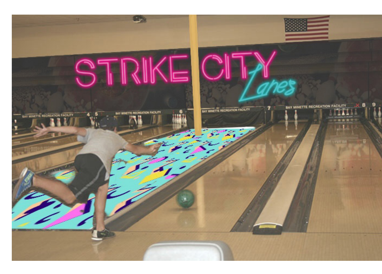
Artistic Rendering of 90's logo with 90's patterned carpet decor; Photo Source: <u>City of Bay Minette</u>

Strike City Lanes 2.0 should launch a stand-alone website to coincide with its rebranding. Websites including an online version of the menu are of the utmost importance to consumers. A study in 2019 concluded that nearly "60% of restaurant guests viewed restaurant website before deciding where to dine." Depending on staffing and capabilities, it is also recommended that Strike City launches an Instagram page featuring its food and drink specials, as well as photos from events such as College Night or themed parties; the same study concluded that "86% of millenials will try a new restaurant after seeing food-related content online."